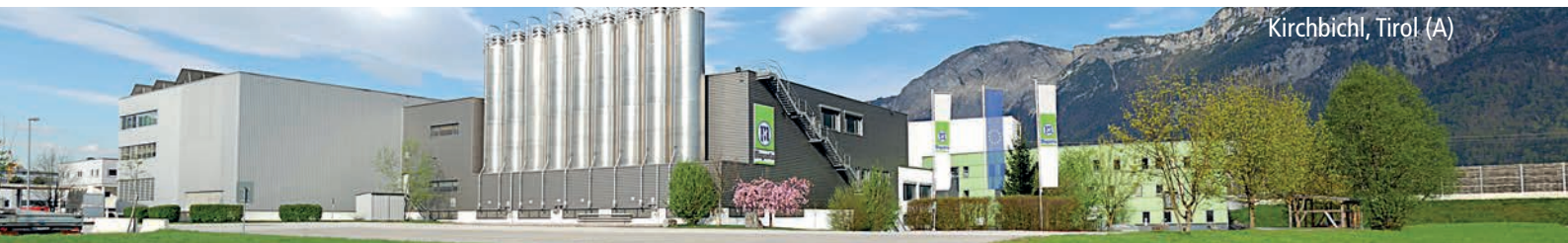
Kirchbichl, Tirol (A)